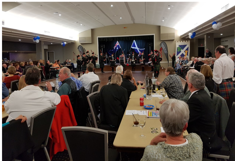
Some of the crowd who enjoyed the evening