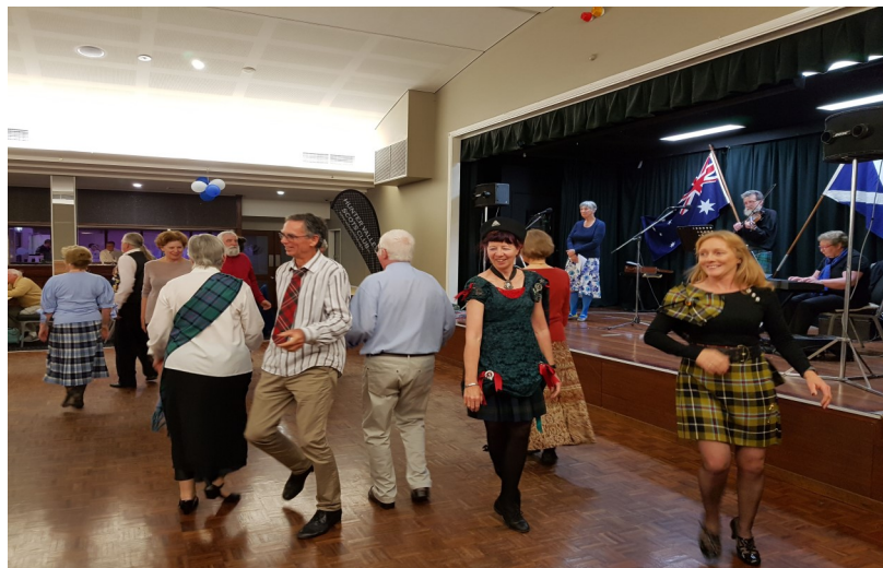
Some of the dancers participating in the frequent opportunities for Scottish dancing